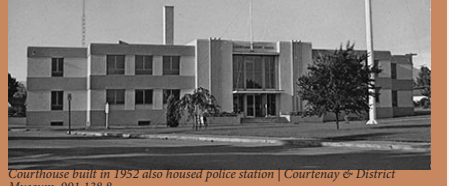
Courthouse built in 1952 also housed police station