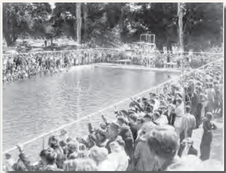
Opening of the Outdoor Pool in 1949