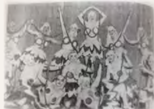
Kinsmen Production for Skattered Skits