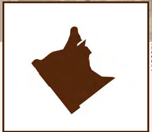
Population: 2,553 in 1951 Map above shows the City boundary during this era.