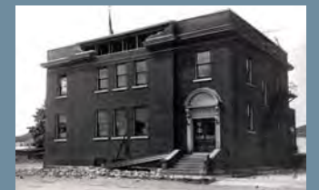
Damage to School and Post Office from Earthquake